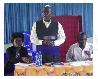
Scholarship award day where students/caregivers signs MOUs and are oriented on all the expectations.