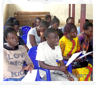
Students taken through the terms of agreement