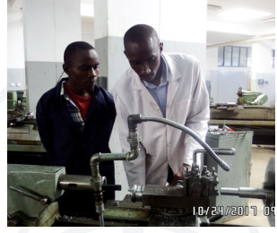
Student taking a course in Mechanical Engineering (Machinist)